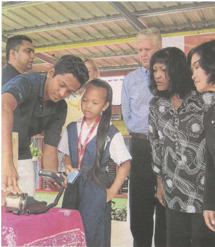
This is how it works: The school principals observing a purchase demonstration made by a pupil using the MyKasih cashless payment system.