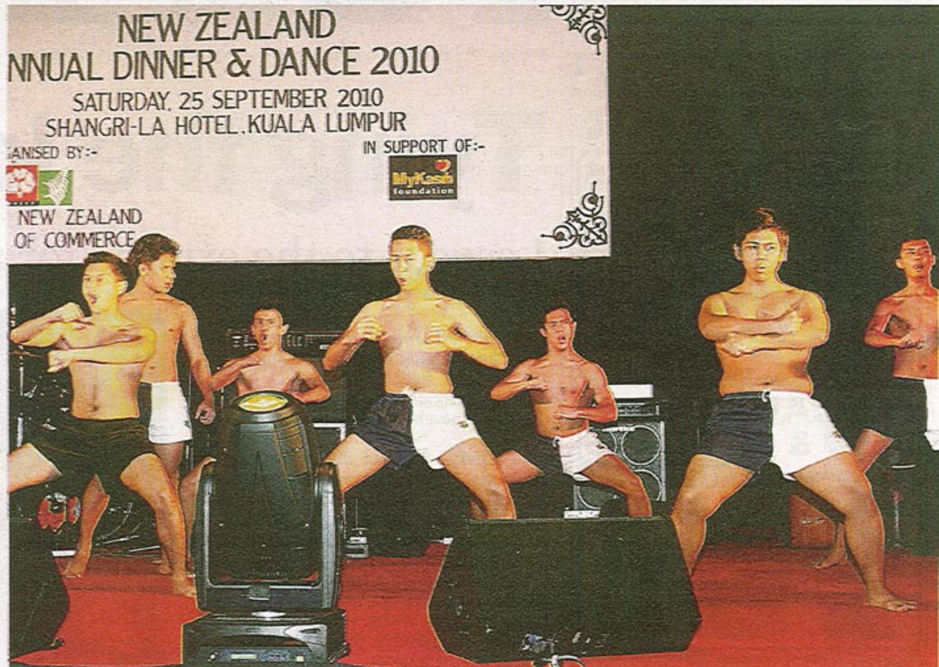
Fierce warriors: A group of youth performing an energetic Maori dance for the crowd.