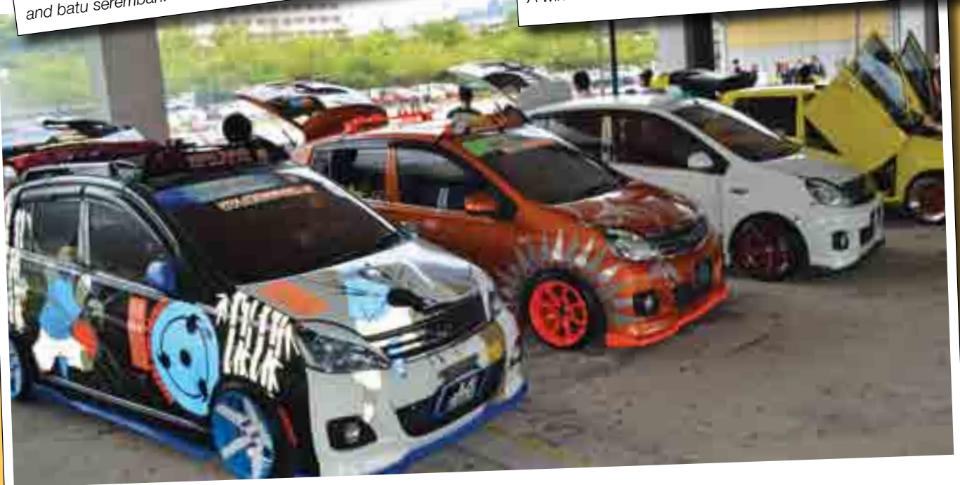
Some of the modified cars on display.