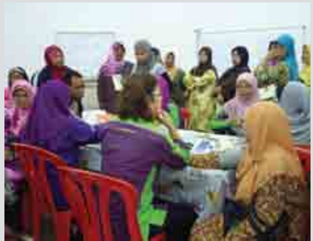
Program Nur Kasih is a health awareness programme which comprises of informative health talks and interactive group discussions on the prevention and early detection of breast and cervical cancers, family planning, nutrition and healthy living. The programme also includes basic medical screening such as blood pressure tests, body mass index checks as well as glucose and cholesterol level tests.