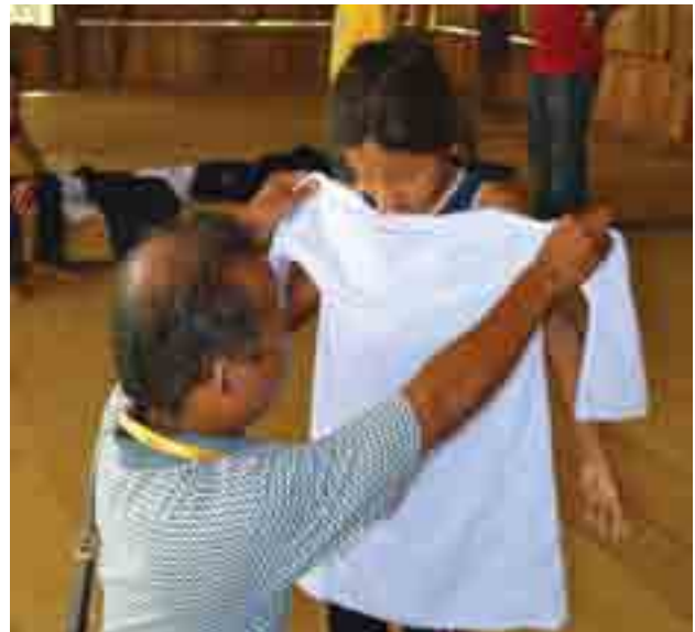
A father helping his daughter try the school uniforms for size.