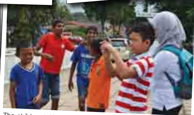
The children taking photos of nature using smart phones to see how their lives relate to nature.