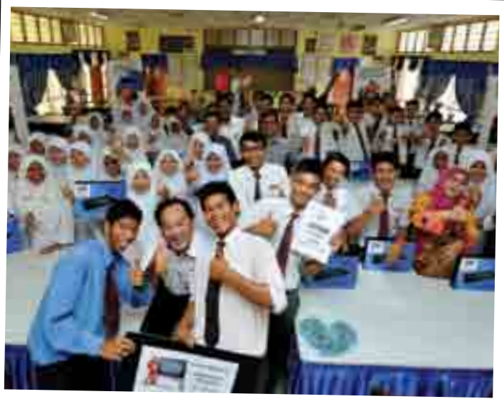
Animation Project - SMK Mergong.