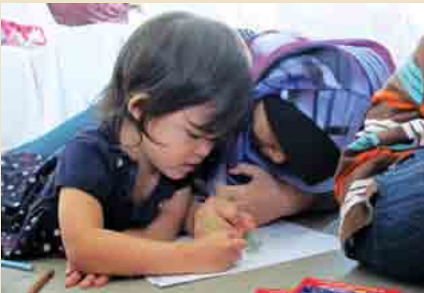
Mother gives her child a helping hand during the colouring competition.