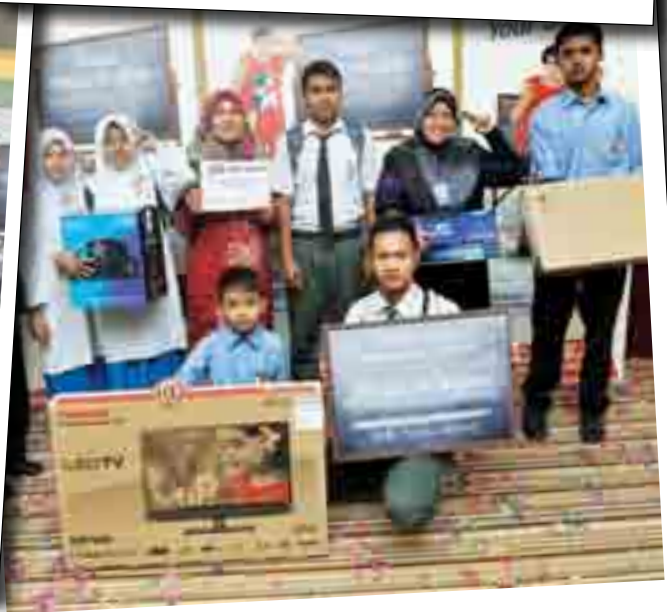
Bonus Round Winner - Sinari Hidupku - SMK Tunku Sulong.