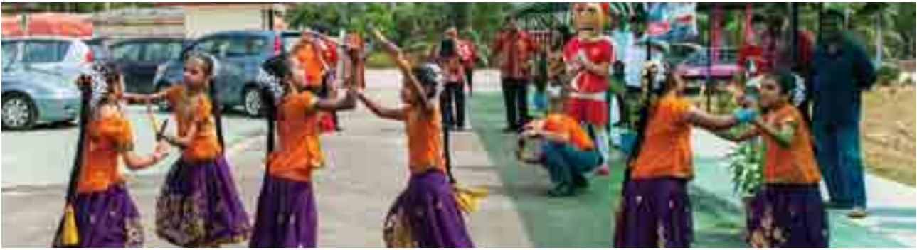
Students performing the 'welcome dance' for the Caltex fuel Your School Team at SJK T Kahang Batu 24.