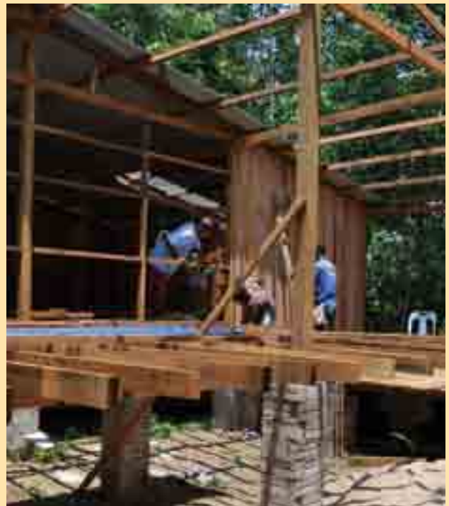
Construction of the Balai Adat took place from June to August 2013.