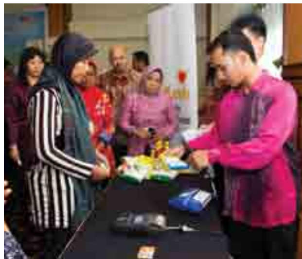
MyKasih officers demonstrating the purchase transaction process using MyKasih's cashless payment system during the launch event.