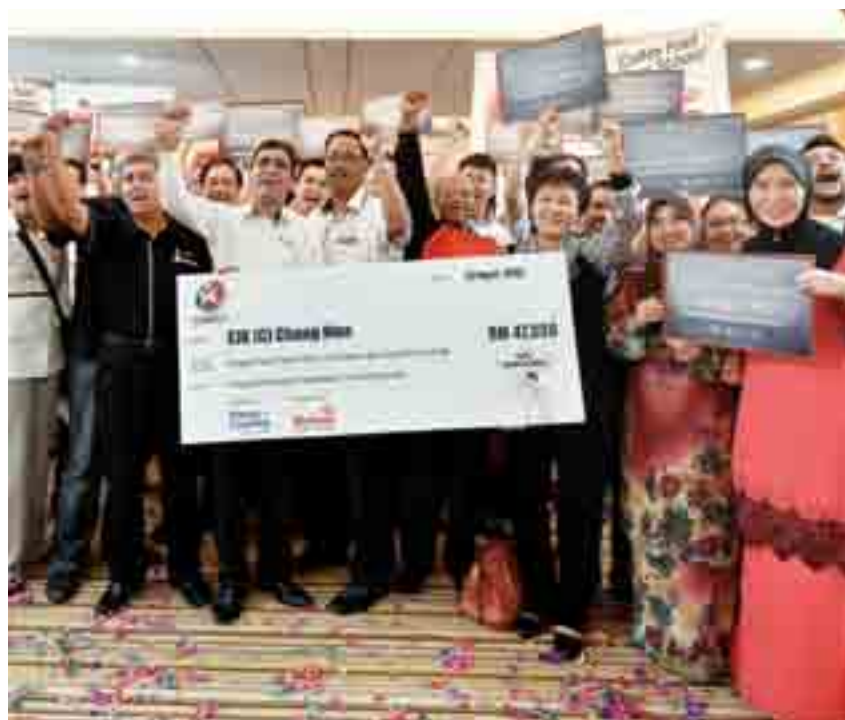
Caltex Fuel Your School!

Community support via social media platforms helped schools across the three states receive classroom project materials to ignite interest among students in learning core subjects. Materials requested in all three states included story books, dictionaries, smart tablets, computers and interactive white boards and even live animals like rabbits and fish!