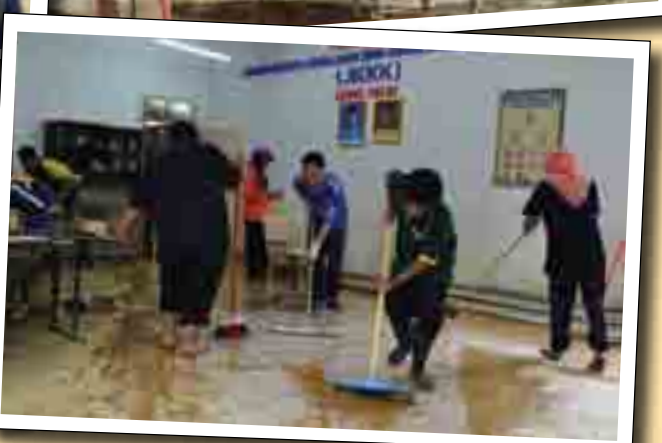
The determined volunteers working very hard to complete the arduous task of washing off stubborn mud and silt off the floors, walls and furniture.