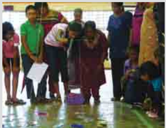
SMARTBelanja@LPPKN is a financial management workshop (conducted on the same day as the health screening) that teaches Sentuhan Harapan families how to plan their monthly expenditure, understand the difference between needs and wants when making purchases, and how to identify good and bad investments. Activities include 'pancing ringgit' (right) and presentations by participants on household budgets (left).