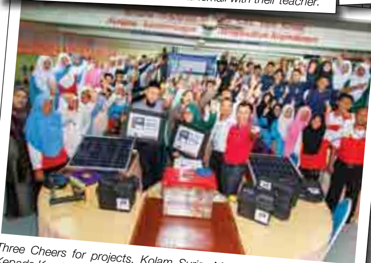
Three Cheers for projects, Kolam Suria, Murid Ceria & Sinaran Ilmu Kepada Kami from SMK Telok Kerang.