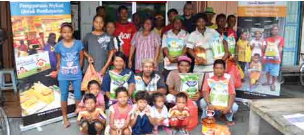
Thank you! – Mah Meri indigenous community of Pulau Ketam, Selangor.

JTI Malaysia had also separately contributed RM 40,000 towards the construction of a multi-purpose 'Balai Adat' (community hall) in Kampung Pian last year, which was built by the Jah Hut Orang Asli community themselves.