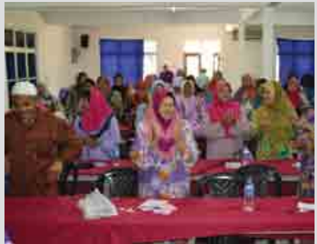
This programme, conducted by the National Population and Family Development Board (LPPKN), covers basic financial management workshops, health awareness talks and basic medical screening. Participants were also counselled and advised on keeping a healthy diet based on their medical screening results.