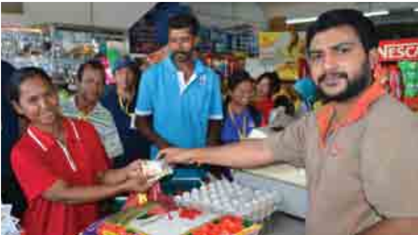
An Orang Asli recipient making her first purchase using her MyKasih smartcard at the community grocery store during the orientation session in Kampung Pian, Kuala Krau, Pahang.