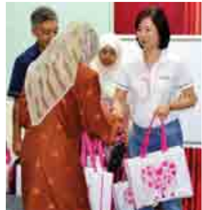
A MyKasih recipient's daughter, who was awarded the Tun Rahah scholarship, receiving the Follow Me gift set containing personal care products which she could use during her dormitory stay on the University Tun Abdul Razak campus.