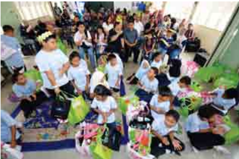
The gift hampers from Tohtonku were much appreciated by the Orang Asli recipient families of Bukit Lanjan.