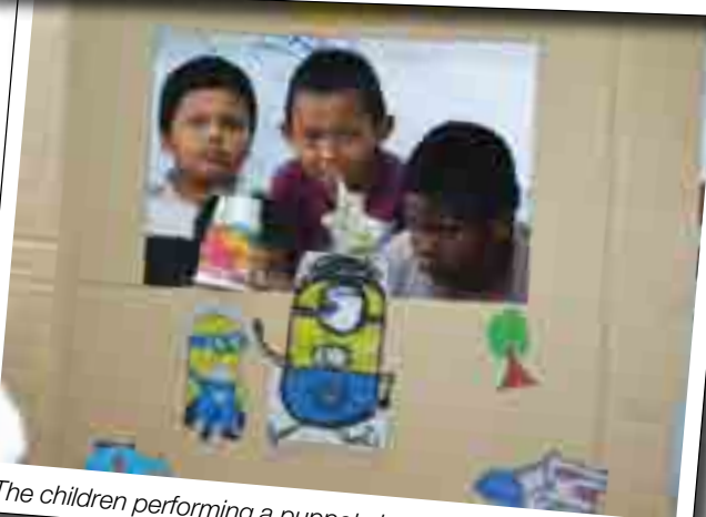
The children performing a puppet show using recycled items.