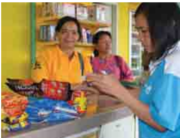
A SHP food aid recipient in Inanam, Sabah making her first purchase at the Kedai Mesra PETRONAS in year 2011.

By the end of 2013, the programme by PSC recorded amazing results whereby a total of 368 participants have since successfully started businesses. The participants recorded a combined income of RM92,907 before the start of the programme and upon completion of the three-month programme, their total combined income increased to RM 224,752. This is an increase in income by an average of 142%!