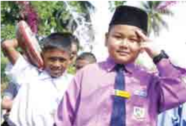
Students of SK Machang Bubok preparing to welcome the Caltex and MyKasih team.