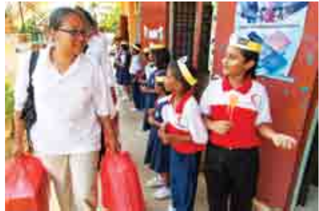
The Caltex Fuel Your School team receiving a warm welcome by students and teachers of SJK (T) Bekok.

Endorsed by the Ministry of Education, Caltex Fuel Your School had Caltex pledging a contribution of RM 1 for every purchase of RM 40 or more at participating Caltex stations in all the three states. Funds generated, including community contributions via MyKasih Foundation, were channeled towards purchasing materials for classroom projects submitted by eligible fulltime educators.