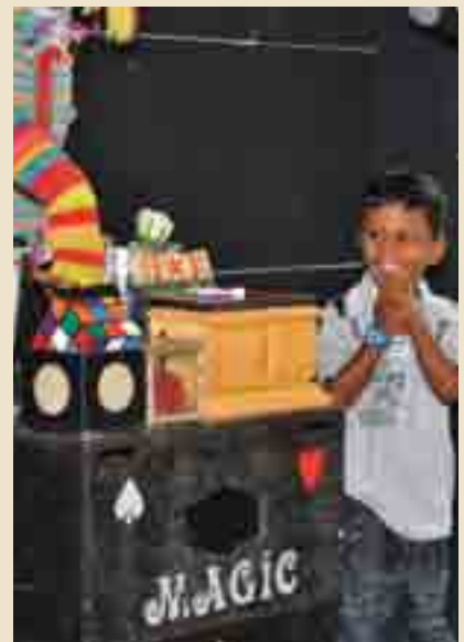
Young boy was extremely excited to be able to participate in the magic show by Banana The Clown.