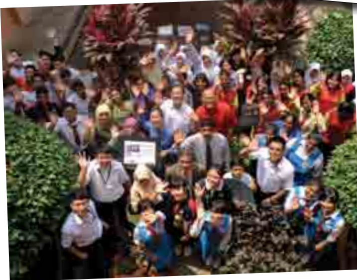
Students and teachers of SMK Padang Serai showing their appreciation.