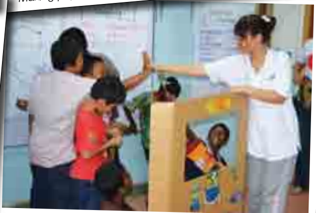
Hi five for a show well done!