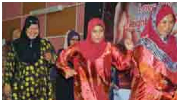
The ladies showing off their new-found confidence and had fun performing in front of their peers.