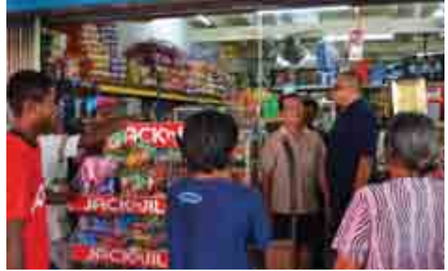
The store owner of Kedai Kim Chin Guan welcomes the group of recipients with a smile.