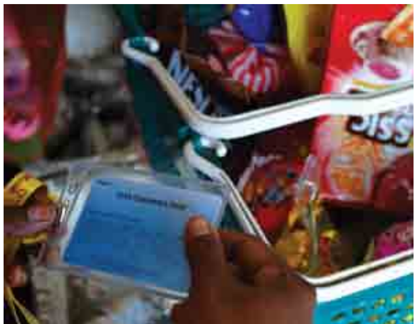
Choice in selecting essential food items is a privileged the poor often do not have. Recipients of Kampung Pian are grateful to CLSA Chairman's Trust for sponsoring their household's food provisions for 12 months.