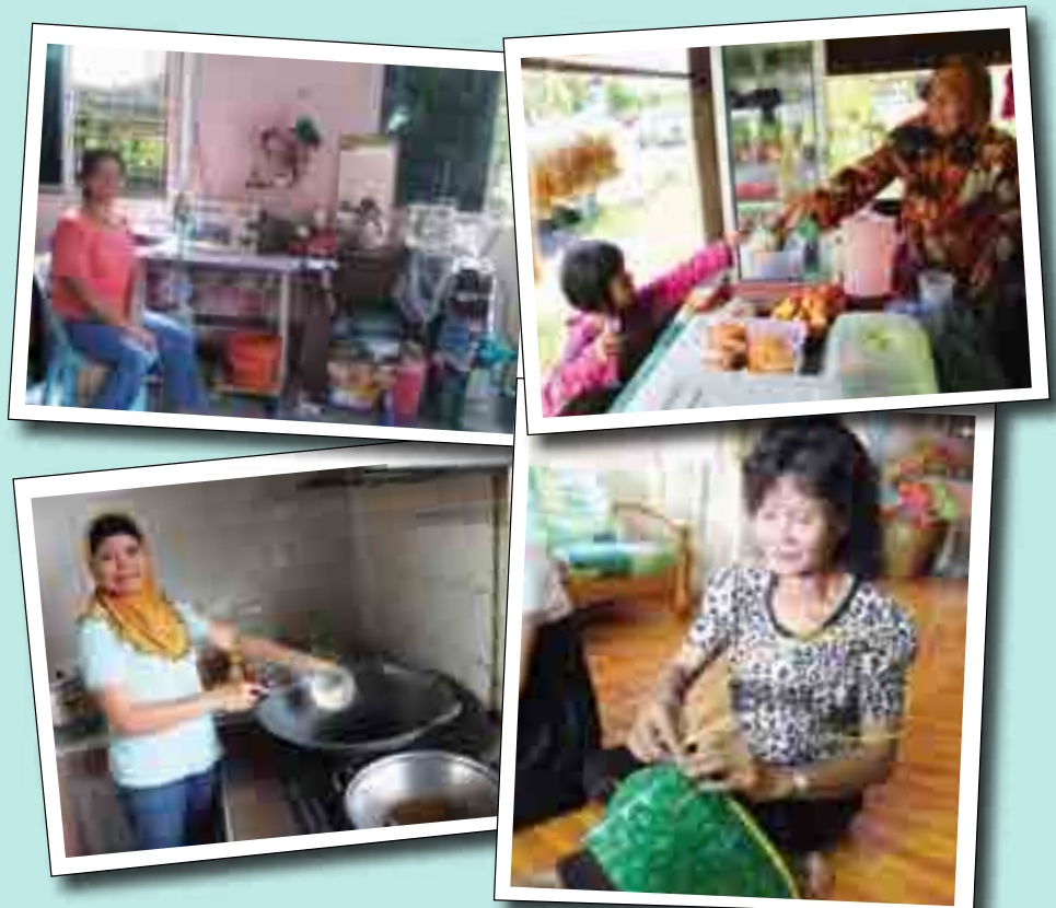
The participants of P3C's entrepreneurship programme successfully applied the knowledge gained from the training sessions into businesses of their choice as shown above.

The training covers modules such as the power of positive thinking, mindset change, customer analysis, business analysis, sales and marketing and financial literacy. Utilising the Blue Ocean strategy, participants also learnt to innovate and perform gap analyses to create a niche market for their businesses.