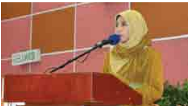
A programme graduate relating her emotional struggles and her successes during the sharing session.

DIALOG has been sponsoring 1,205 low-income households in Selangor, Pahang, Terengganu, Melaka, Johor and Sabah under the MyKasih ‘Love My Neighbourhood’ food aid programme since 2009.