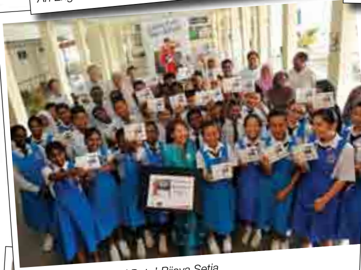
Dictionary Me - SMK Dato' Bijaya Setia.