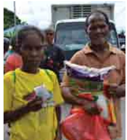
Recipients will receive a receipt after each successful purchase showing the remaining balance of funds in their MyKad account.