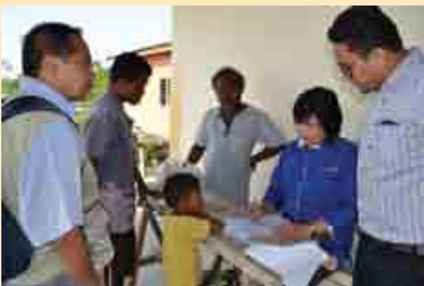
A JAKOA officer (in blue) helping to fill up the registration form for the Mah Meri Orang Asli recipients during the registration process.

JT International Berhad (JTI Malaysia) has renewed its donation pledge to support 1000 families for a second consecutive year and has included Orang Asli communities in its JTI-MyKasih food aid programme - such as the Jah Hut village of Kampung Terbol in Pahang, the Mah Meri villages of Pulau Carey and Pulau Ketam in Selangor, as well as the Seletar villages in Johor.