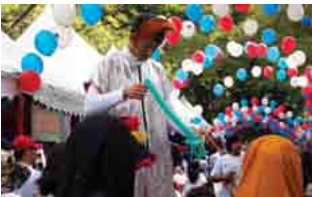
It was a carnival-like atmosphere at Padang Merbok in Kuala Lumpur during the Alliance Bank Fun Run.