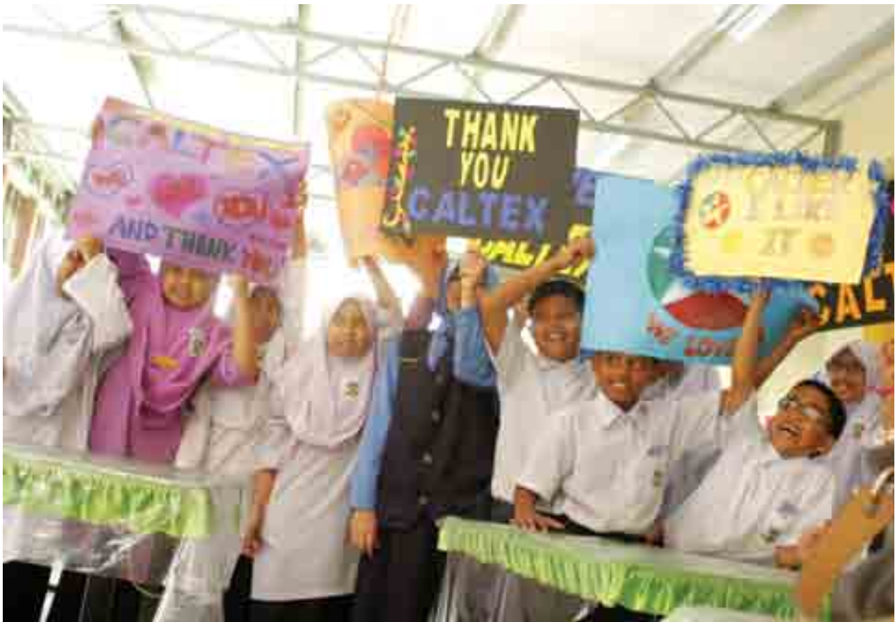
Students saying thank you to Caltex for fueling up their school with fun educational materials.