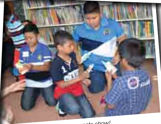
Making puppets for the puppets show!