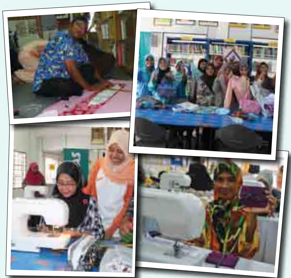
Snapshots of SHP recipients who participated in the sewing skills training programme in various locations throughout Peninsular Malaysia.

Apart from sewing skills, the participants also underwent entrepreneurship training and business-matching sessions attended by potential buyers.