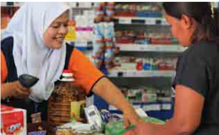
The cashier explaining to a recipient about the barcode scanning process, which ensures that only approved food items under the food aid programme can be purchased using the MyKasih card.