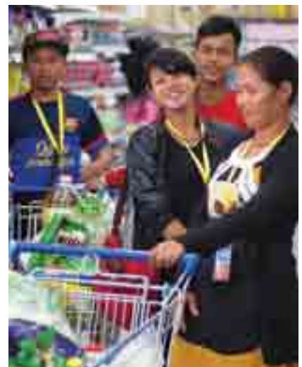
Happy faces seen on the first day of food purchases under the MyKasih programme – Orang Asli of Kampung Tanjung Rambai, Hulu Langat, Selangor.

JT International Berhad (JTI Malaysia) has renewed its donation pledge to support 1000 families for a second consecutive year and has included Orang Asli communities in its JTI-MyKasih food aid programme - such as the Jah Hut village of Kampung Terbol in Pahang, the Mah Meri villages of Pulau Carey and Pulau Ketam in Selangor, as well as the Seletar villages in Johor.