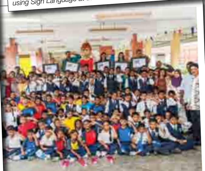
Kudos!!! SJK (T) Ladang Mount Austin won 5 projects!