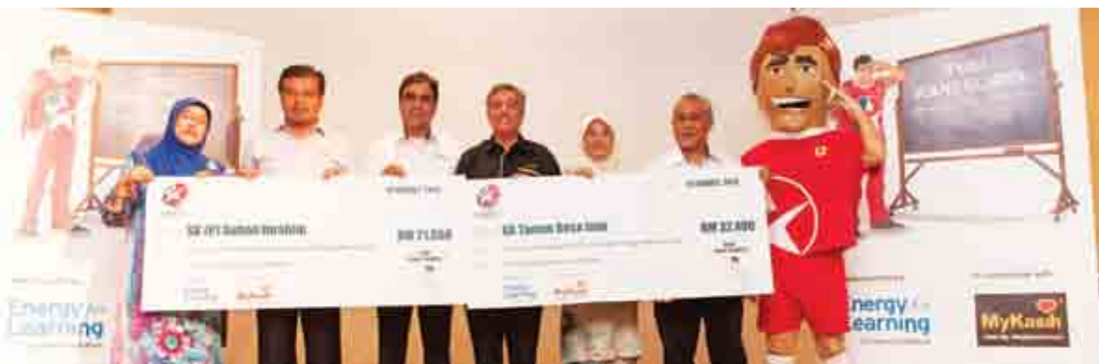
Cheque presentation to SK (P) Sultan Ibrahim and SK Taman Desa Jaya for the 'Love My School' programme in Johor.

Winners were awarded based on the highest number of community "likes" achieved by individual projects on the campaign's Facebook application across voting cycles, which included a special Bonus Round. Surplus funds from the Caltex pledge went to MyKasih Foundation's 'Love My School' bursary scheme to support students from lower income families purchase food and school books for a year at two schools in Johor and one in Kedah.