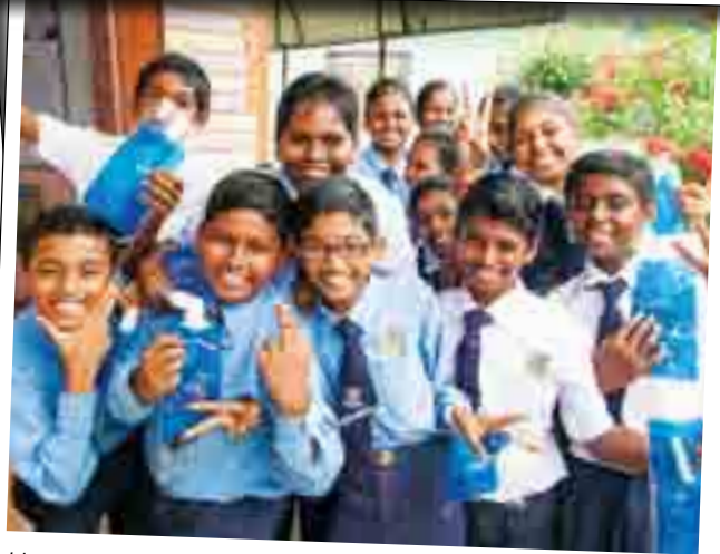
Happy faces from students of SJK T Ladang Tanah Merah.