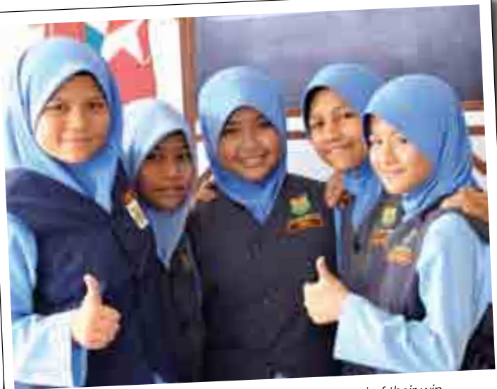
Thumbs up! The girls from SK Selama were very proud of their win.