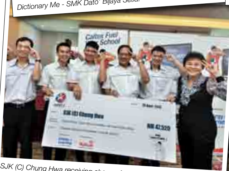
SJK (C) Chung Hwa receiving cheque for 'Love My School'.