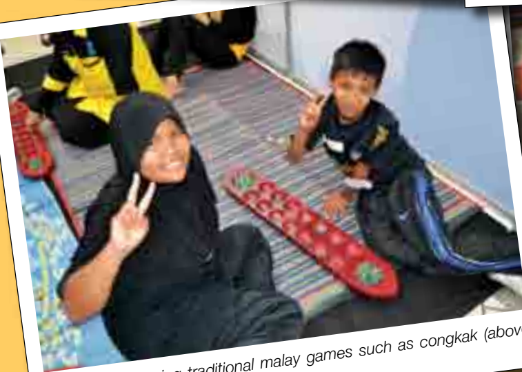
The children playing traditional Malay games such as congkak (above) and batu seremban.