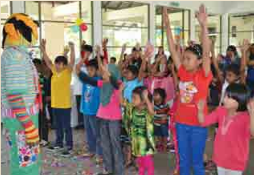
"Who wants to play games and win prizes, raise both your hands!"