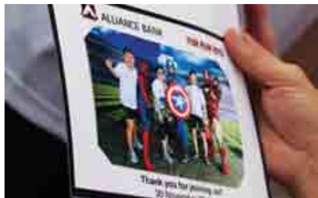
Photo booths were a hit amongst the Alliance Bank staff and family members.