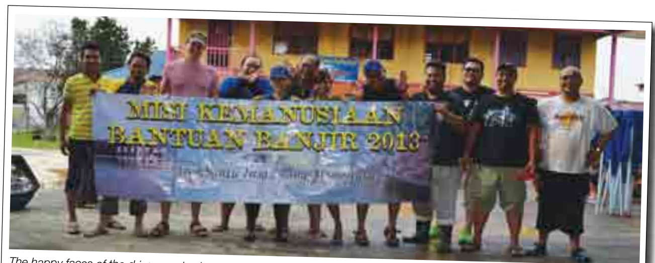
The happy faces of the drivers and volunteers after a hard day's work says it all. Well done, everyone!