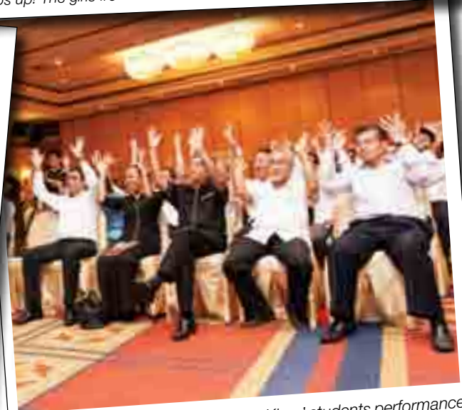
Guests Cheering at SK Pendidikan Khas' students performance using Sign Language at the Closing Ceremony.