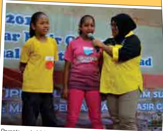
Parents and children participating in the trivia game. The fastest person onstage with the correct answer wins!