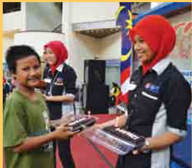
Towards the end of one-day, Politeknik Ibrahim Sultan students prepared a wonderful surprise for the MyKasih children. The students sang the Happy Birthday song and presented every MyKasih child with a birthday cake with their names written on it! Their happy faces say it all.