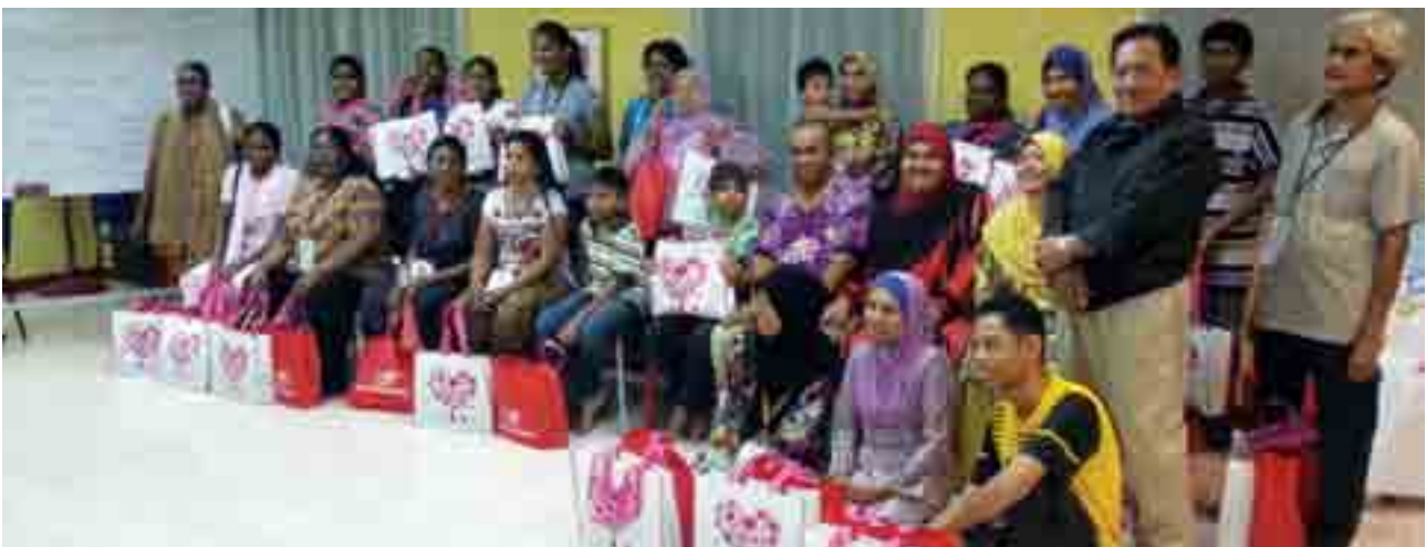
MyKasih recipient families from Kayu Ara with their Follow Me gift hampers which were distributed in conjunction with the Hari Raya celebrations.