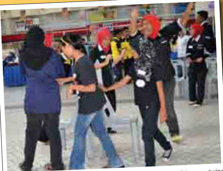
The big sisters from Politeknik Ibrahim Sultan cheering the children on during the Musical Chairs game!