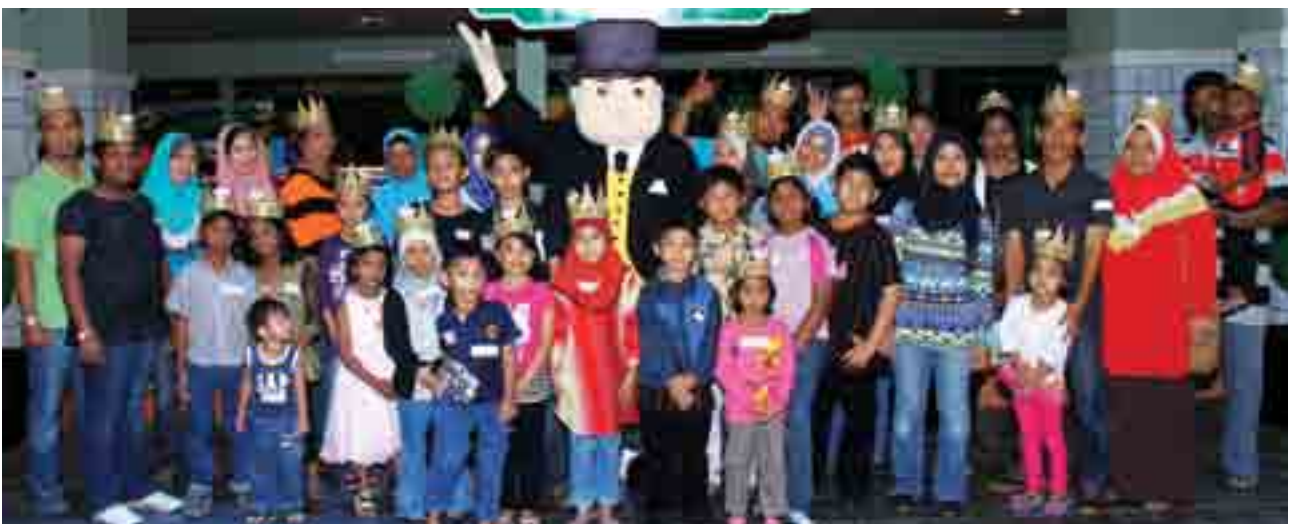
The eager children accompanied by Sir Topham Hatt, the head of the railway, waiting at Knapford Station to get on board Thomas for a thrilling ride!

MyKasih would like to thank The Little Big Club for organising such a fun activity for the MyKasih children from the Gelang Patah, Johor community.