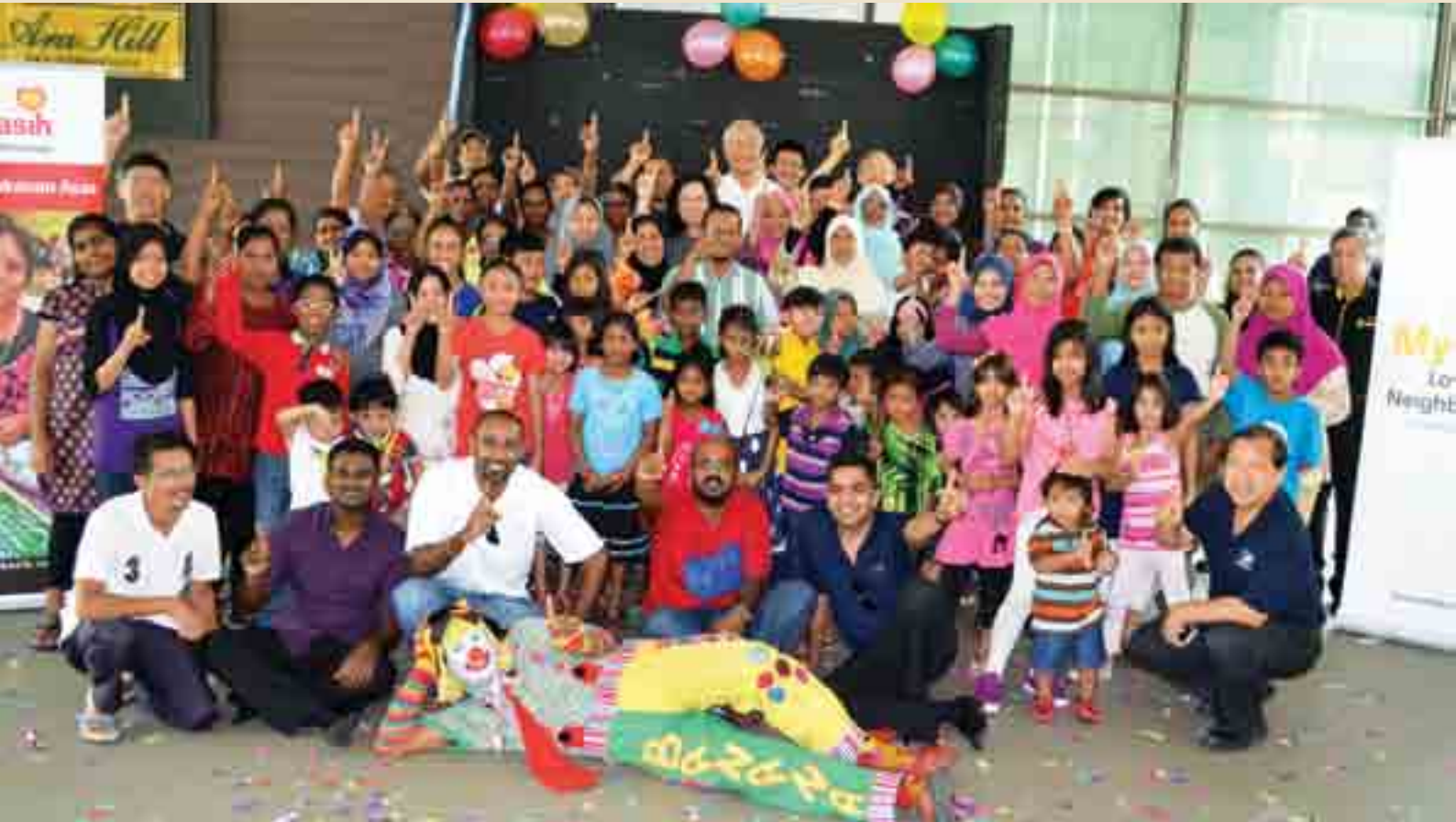
A group photo with the MyKasih families from Kayu Ara and Kelana Jaya.