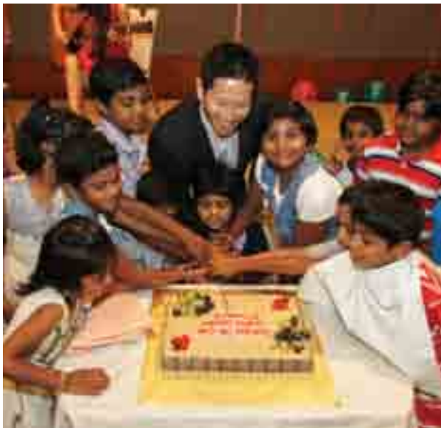
Sweet treats are always a delight to the children!

"By cultivating values such as giving and sharing amongst the privileged mass, we hope to inspire more acts of kindness from society to make a difference in the lives of the less fortunate." he ended.