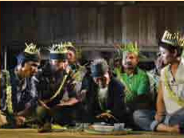
Since September 2013, the Balai Adat in Kampung Pian has been used for traditional ceremonies, workshops and also story-telling - a culturally-significant part of the Orang Asli way of life to convey folk tales and other important learning from generation-to-generation.

After its completion in September 2013, the Balai Adat has been used for traditional ceremonies, as well as gatherings for meetings and workshops.