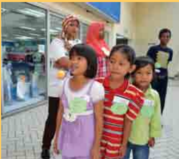
The MyKasih children waiting for the sound of the whistle to start the Spoon Ball game.