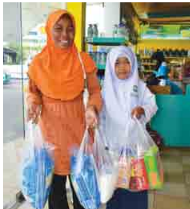
A happy recipient in Inanam, Sabah was all smiles after successfully purchasing food items with her daughter.

SHP is supplemented with various activities and trainings to encourage self-development and enhance the skills and capabilities of the recipient families so that they can break out of the poverty cycle and are no longer dependent on welfare.