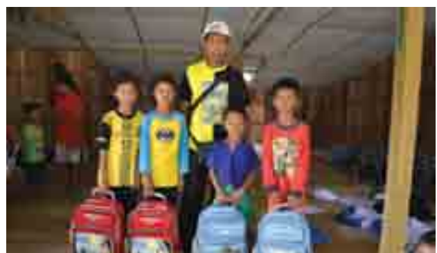
Top and above: Back-To-School items sponsored by CLSA Chairman's Trust for 100 school-going Jah Hut Orang Asli children.