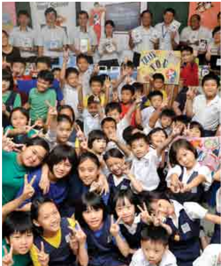
The happy students of SJK (C) Chio Min A posing cheekily for the camera.

The Caltex Fuel Your School community campaign is a social investment initiative aligned to Chevron's Energy for Learning global initiative to support learning-based programmes that help people acquire new knowledge, gain new skills and be exposed to different ways of thinking.