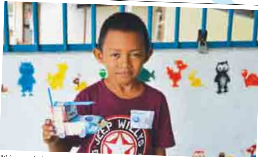
All human beings are not born the same. Every individual has different abilities. - Muhammad Ikhwan.