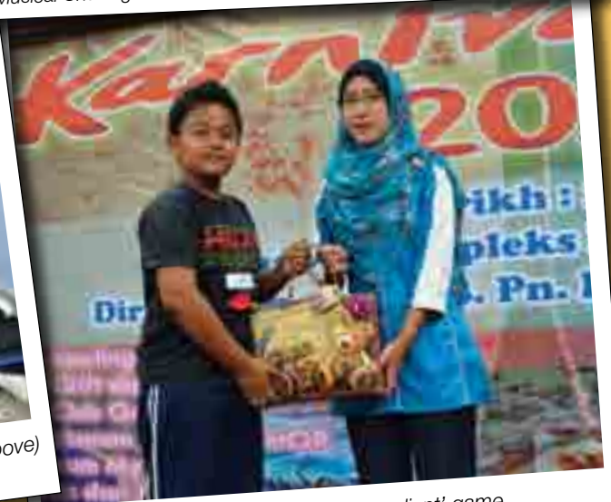
A winner of the 'Guess-the-Food-Ingredient' game.