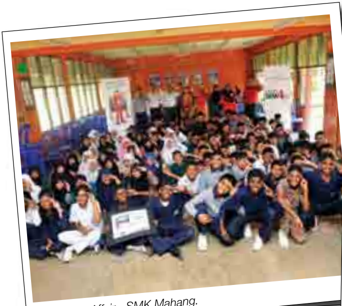
An English Affair - SMK Mahang.