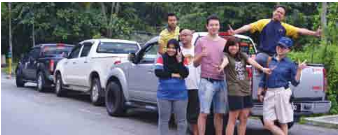
JTI Malaysia’s eager beavers together with other volunteers excited to begin scrubbing the community centre clean.