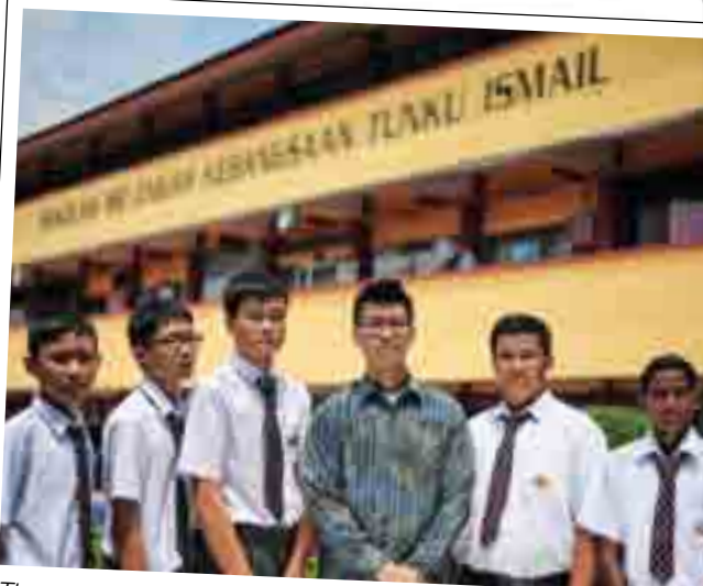
The student winners from SMK Tunku Ismail with their teacher.