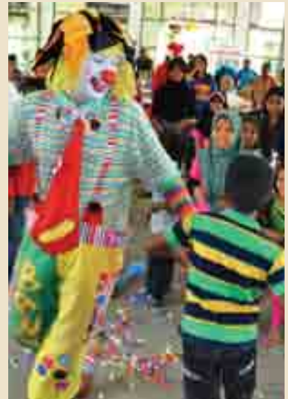
Banana The Clown dancing with the children.